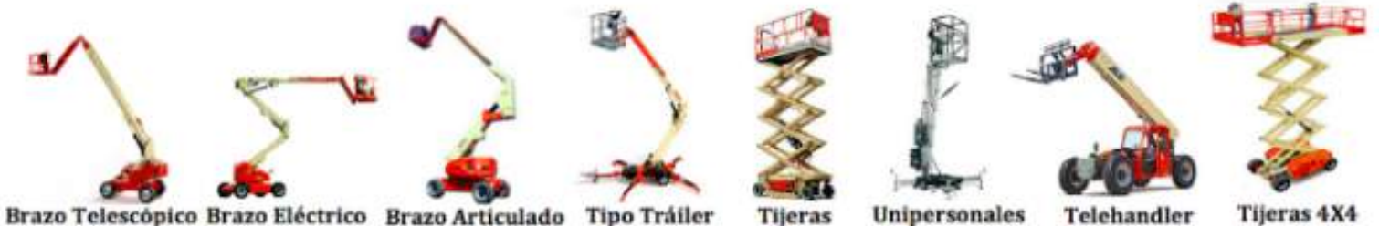
Brazo Telescópico Brazo Eléctrico Brazo Articulado Tipo Tráiler